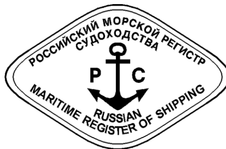
Fig. 2.6 Imprint specimen of the RS surveyor's stamp

2.6 The RS surveyor's stamp imprint is shown in Fig. 2.6 .