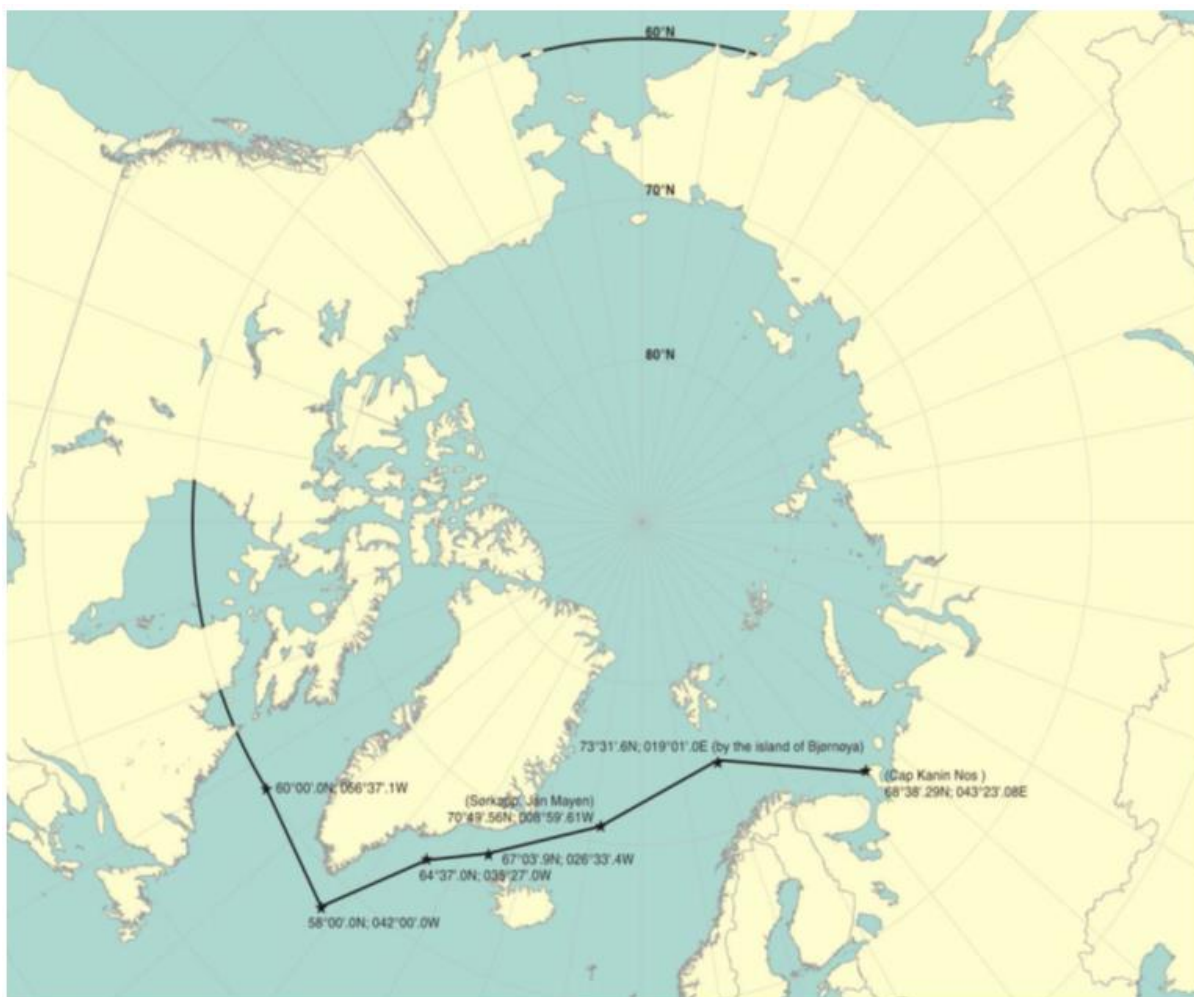
Fig. 1.1.1-1 Maximum extent of Arctic waters application 1

.1 Arctic waters are those waters which are located north of a line from the latitude 58°00',0 N and longitude 042°00',0 W to latitude 64°37',0 N, longitude 035°27',0 W and thence by a rhumb line to latitude 67°03',9 N, longitude 026°33',4 W and thence by a rhumb line to the latitude 70°49',56 N and longitude 008°59',61 W (Sørkapp, Jan Mayen) and by the southern shore of Jan Mayen to 73°31',6 N and 019°01',0 E by the Island of Bjørnøya, and thence by a great circle line to the latitude 68°38',29 N and longitude 043°23',08 E (Cap Karin Nos) and hence by the northern shore of the Asian Continent eastward to the Bering Strait and thence from the Bering Strait westward to latitude 60° N as far as Il'pyrskiy and following the 60th North parallel eastward as far as and including Etolin Strait and thence by the northern shore of the North American continent as far south as latitude 60° N and thence eastward along parallel of 0° N, to longitude 056°37',1 W and thence to the latitude 58°00',0 N, longitude 042°00',0 W (refer to Fig. 1.1.1-1 );